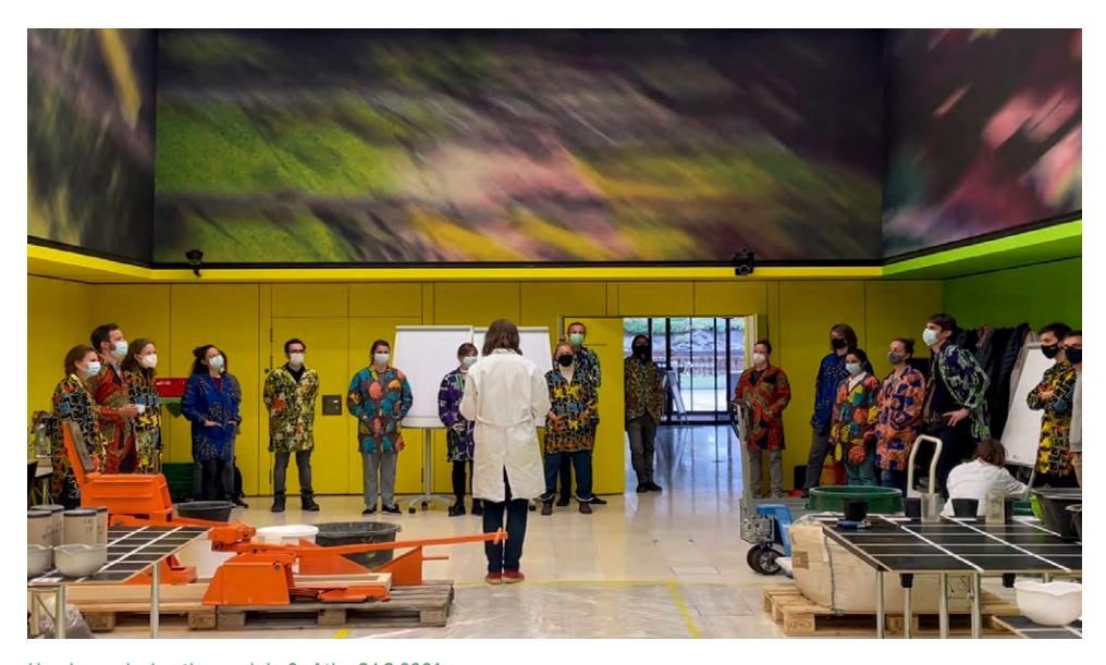
Hands-on during the module 2 of the CAS 2021