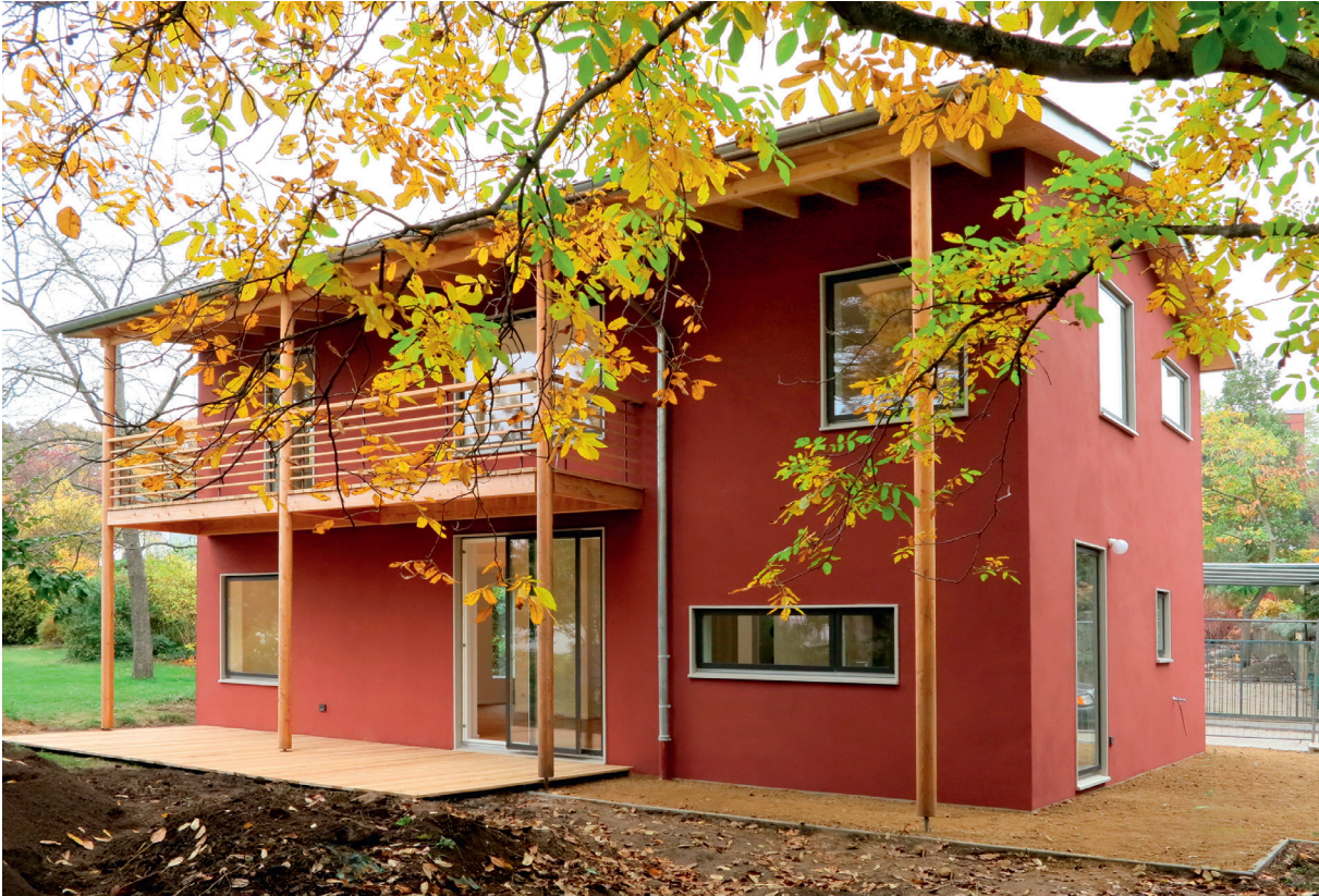
Figs. 3-6 Haus J, Darmstadt. 3: Completed building after a construction period of six months: the shell of heavy straw light earth is coated with a lime render. 4: The continuous earth shell enveloping the house took approximately four weeks to dry out. 5: Timber structure with a lattice of battens onto which the light earth is applied. The roof protected earth construction works from the weather. 6: Preparation of clay slurry from dry earth with a Knauf PFT G4 mixing machine.