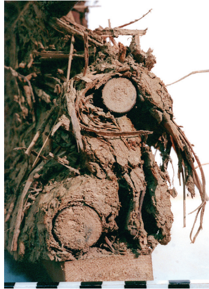
02 Section through historical straw-clay panel infill, showing wrapping technique, Limburg, 17th century

tion of straw was greater and that of earth less than originally supposed. Indeed, some historical accounts describe the need to mix in “as much straw as possible” with the manure fork so that it resembles stable manure, and that simply treading the earth mass and adding “some straw” often produced a heavy, insufficiently stabilised mass. But the material density is not the only difference: the application technique and details of the new method differ from common historical methods in many respects.