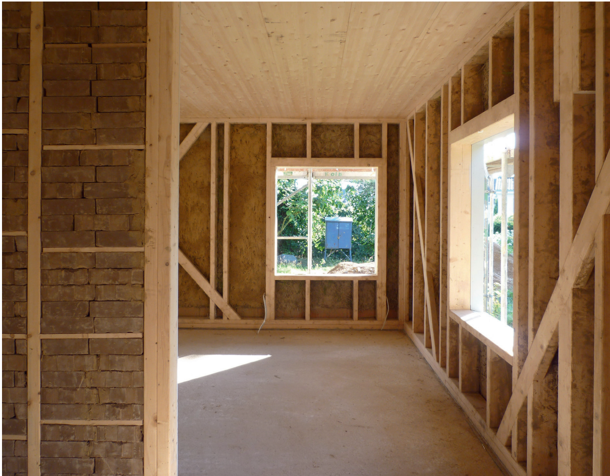
Fig. 8 Haus J, shell of construction seen from inside. Once dry, internal plasterboard is applied and the cavity filled with cellulose blow-in insulation. The internal walls are filled with dry-stacked earth bricks, i.e. without mortar.

drying in-between) of between 5 and 50 mm thick, which is sufficient to level out irregularities and holes in the substrate. The resulting surface is roughened and, once dry, plastered over with a fine clay or lime plaster (figure 11).