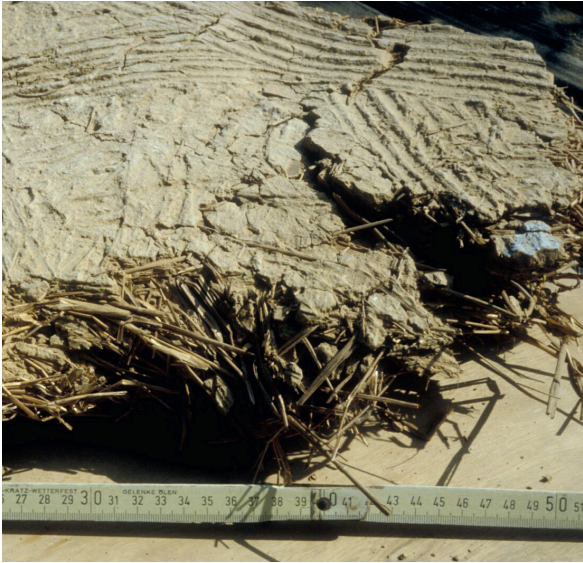
Abb. 1 Historical straw-clay panel infill material with a high straw content, 1200 kg/m 3 , Darmstadt, 18th century